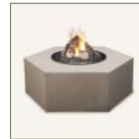
FIRE PIT BUILDER SET* (UNFINISHED)