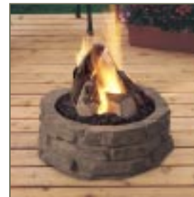
ROCK RING BASE*